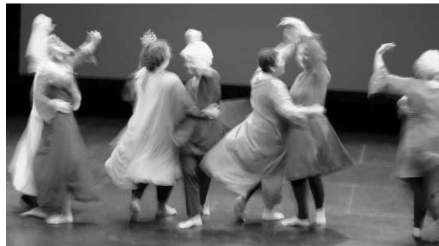
Crossings program participants performed at The Kitchen in New York City in March.